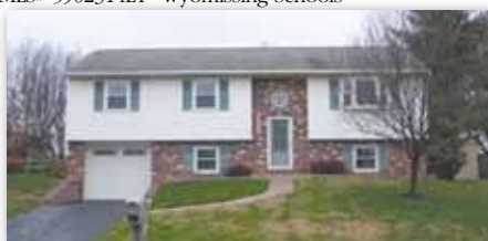
WELL KEPT BI-LEVEL FULL OF SURPRISES 97 Butternut Ct., Wernersville Offered for $169,000 MLS# 5975948LT