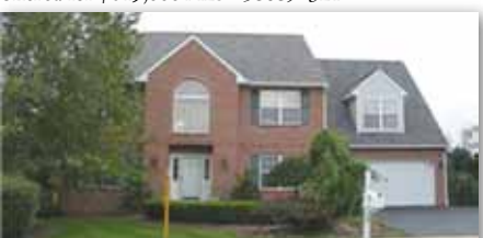
STUNNING 5 BED, 3 1/2 BA IN WILSON SCHOOL DISTRICT. 135 Lucinda Lane - Offered for $369,900 MLS# 5953015LT