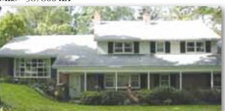
"BIRDLAND" SPECIAL TRADITIONAL 4 BEDROOM 1306 Old Mill Road, Wyomissing MLS# 5953141LT Offered for $350,000